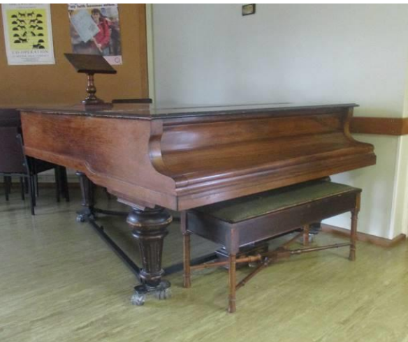
Figure 6: Bluthner grand piano