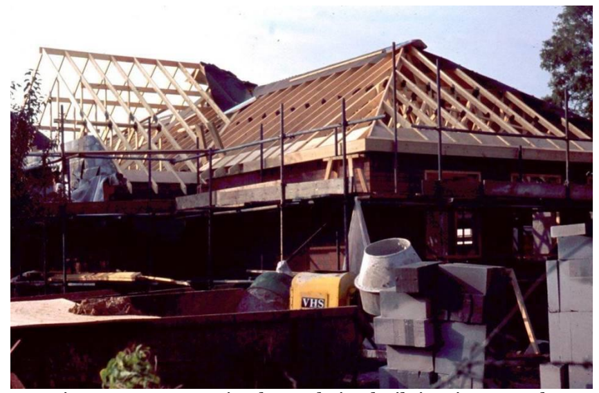
Figure 2: New meeting house being built in Kings Heath

By the mid-twentieth century, as a result of a decline in membership and the increasing costs of running the Friends' Institute, discussions were held regarding relocating the meeting to Kings Heath. There was still an undeveloped site on the land purchased in Kings Heath in 1937. It was also a time when other institutes such as Selly Oak and Northfield were relocating to smaller new purpose-built meeting houses and the institutes were given to the city for community purposes. Agreement was reached to build a new meeting house in Kings Heath, with provision planned for expansion if required in the future. The institute passed into the ownership of the city in March 1983 and the new meeting house in Kings Heath was built by S.T. Walker & Partners in January 1983. One of the ten properties which were built in 1939 was subsequently allocated as a warden's house.