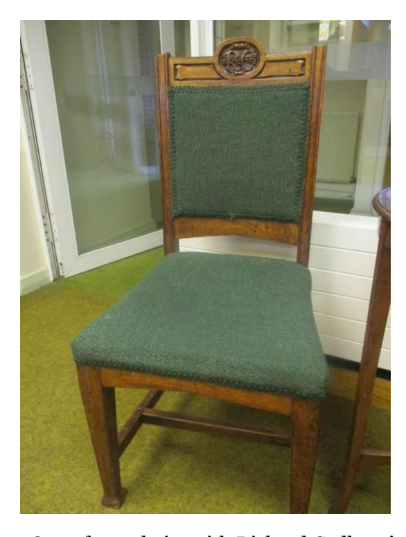
Figure 7: One of two chairs with Richard Cadbury's initials