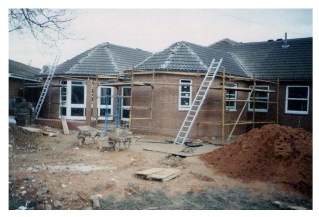
Figure 3: 1987 extensions to Kings Heath meeting house

Four years after the meeting house had been built more space was required for storage and for additional meeting rooms. A local Quaker, Geoffrey Collins suggested the meeting house should be extended, which was agreed. Collins, along with his colleagues at Harry Bloomer Partnership designed an extension consisting of a new rear entrance, storage rooms, an office and enlargement of one of the existing meeting rooms. The extension was completed in 1989.